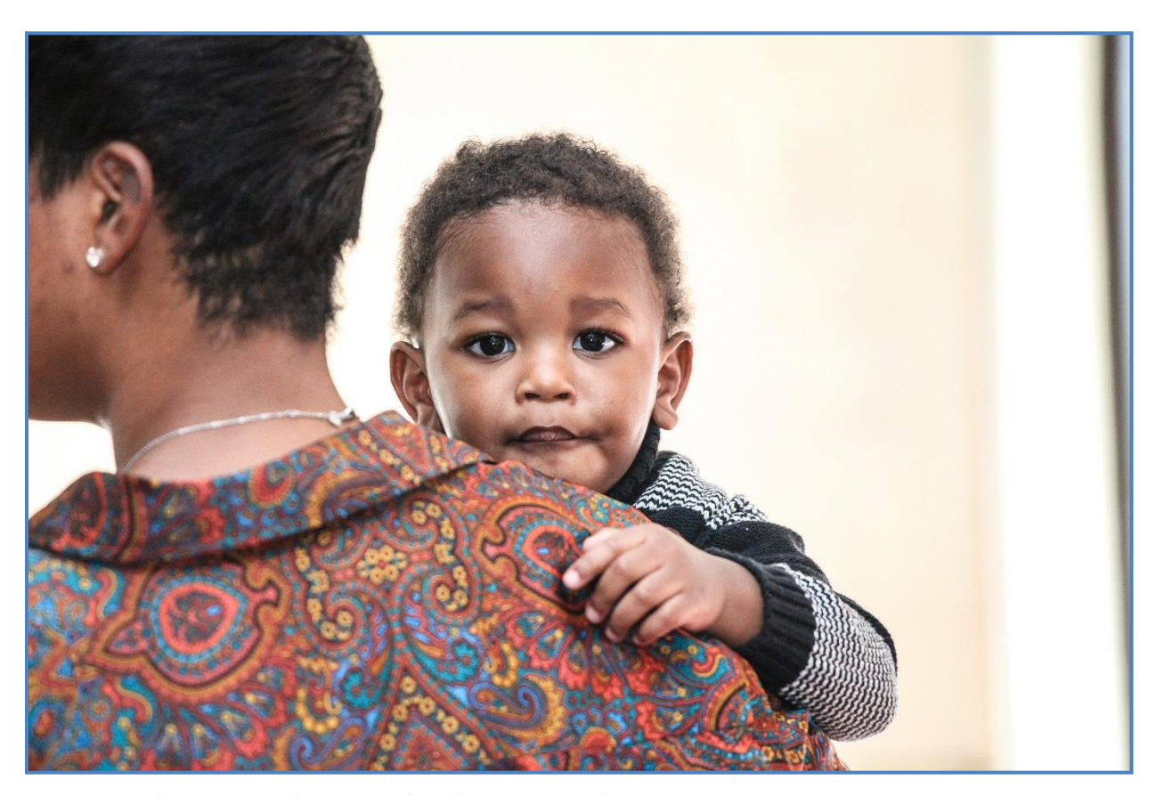
A young attendee at a My Brother's Keeper launch event in Newark, New Jersey, January 8, 2015.

The sections below outline the six milestone areas identified by the Task Force as the most impactful and effective intervention points of young people's lives--from their early years through young adulthood. Each section contains foundational perspectives on why each intervention point is so critical, and the types of work being done at the federal and local level to address the recommendations.