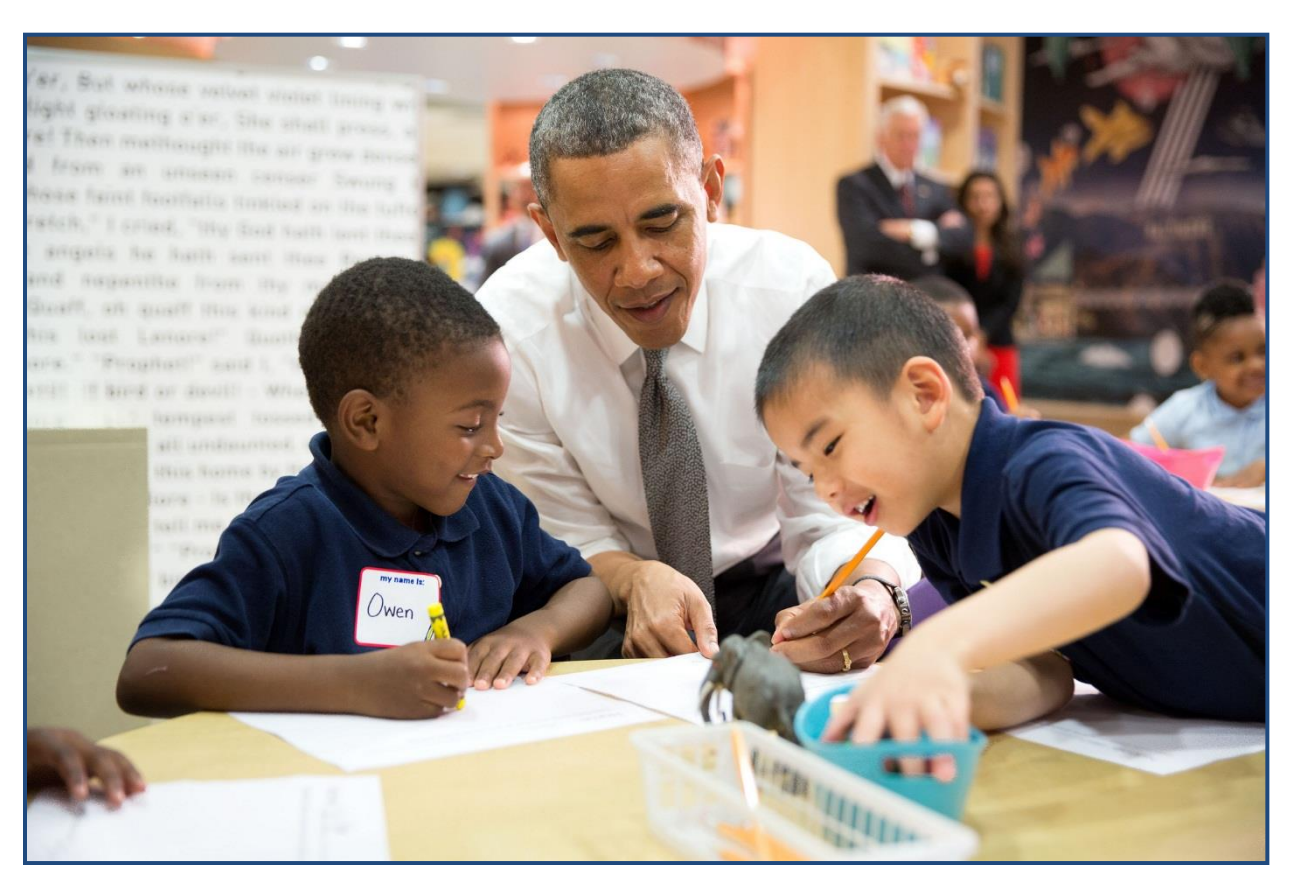
President Obama with students at Moravia Elementary School in Baltimore, Maryland, May 17, 2013.

In December 2014, HHS and ED issued a joint policy statement that provides recommendations to states and early childhood programs intended to prevent, severely limit, and eventually eliminate expulsion and suspension practices in early learning settings. Recommendations included establishing fair and developmentally appropriate policies and implementing those policies without bias and investing and implementing enhanced prevention programs. To accompany the policy statement, HHS also announced a $4.4 million investment in early childhood mental health consultation, an evidence-based practice with demonstrated effectiveness in reducing expulsion and suspension, increasing children's social skills, improving teacher-child interactions and classroom climate, and decreasing teacher stress and turnover. HHS and ED have begun wide dissemination of the policy statement through a series of targeted webinars for state and local leaders around the country.