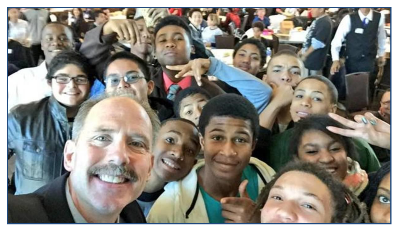
Mayor Richard Berry and local youth at a My Brother's Keeper Action Forum in Albuquerque, New Mexico, January 16, 2015.

Each Challenge Community has up to 180 days after accepting the Challenge to officially unveil its comprehensive action plan. The federal government does not sponsor, supervise, or independently evaluate the efforts of these localities. But the communities themselves have reported many encouraging signs of progress and momentum. Some of those independent efforts are highlighted below, with information received from the communities themselves, to provide a sense of the broad work being performed to help ensure all youth have the opportunity to realize their full potential.