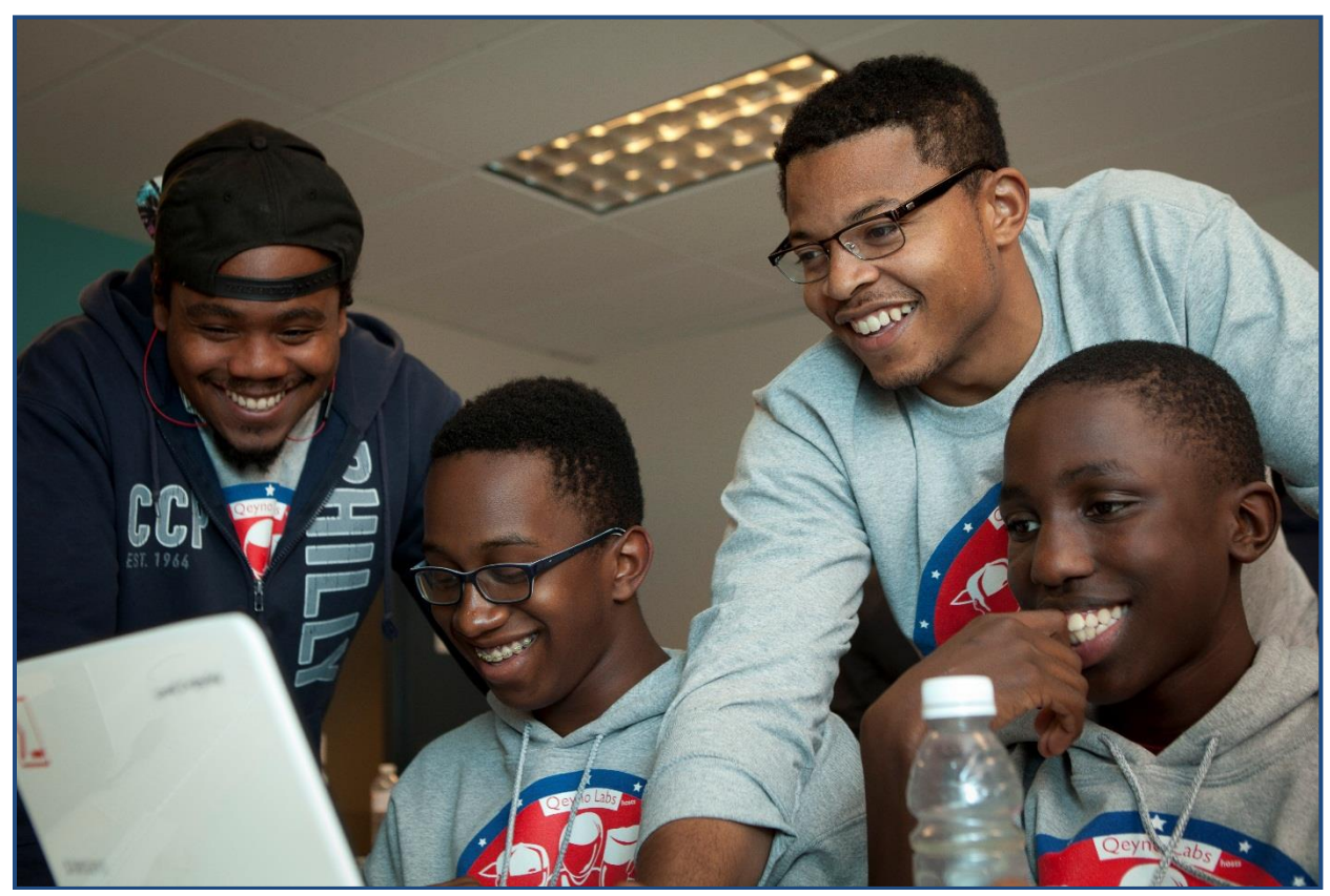
Students at the My Brother's Keeper Hackathon in Philadelphia, Pennsylvania, November 2014.

specialized services will prepare individuals for employment while they are incarcerated to increase their opportunities for successful reentry into their communities upon release. LEAP builds on promising strategies being implemented in a number of correctional facilities across the country, including the MontgomeryWorks Satellite One-Stop Career Center/American Job Center within the Montgomery County, Maryland county jail system.