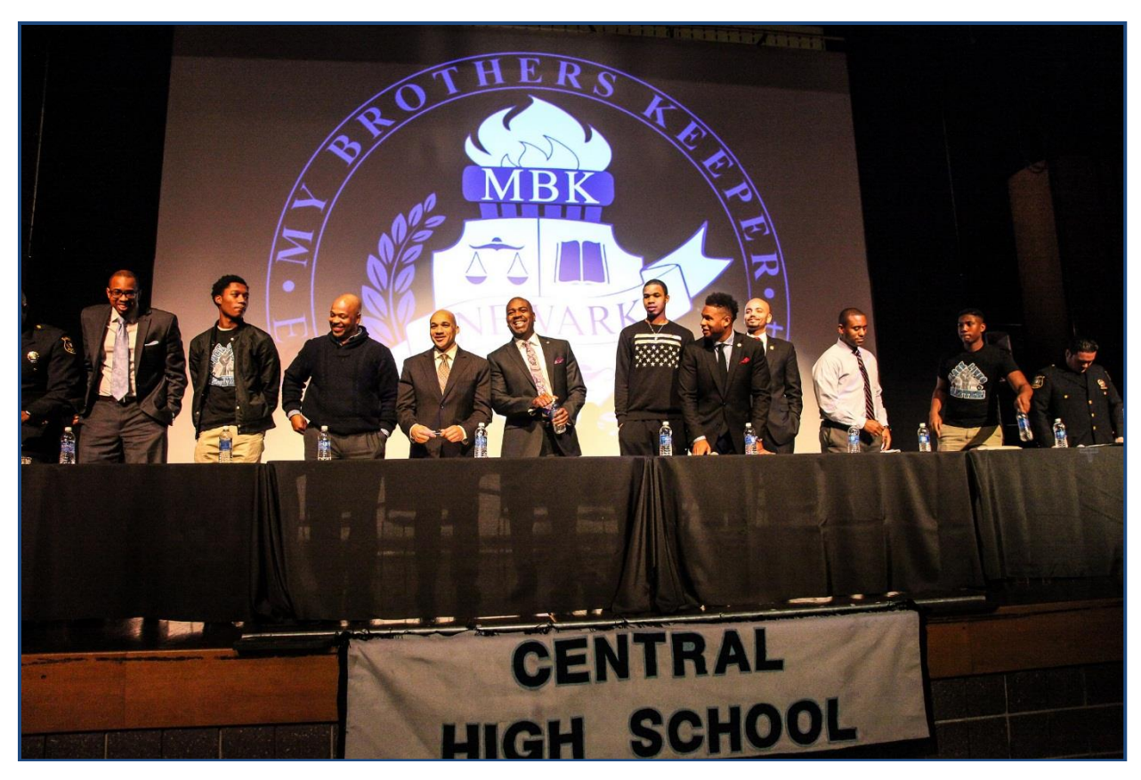
Mayor Ras Baraka and other dignitaries at a My Brother's Keeper forum in Newark, New Jersey, January 6, 2015.