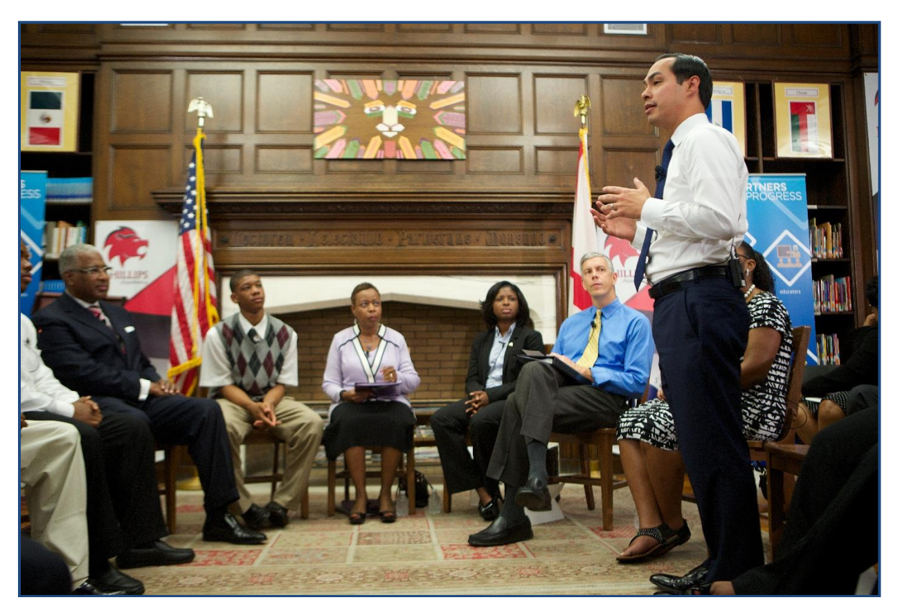
U.S. Department of Housing and Urban Development Secretary Julian Castro and U.S. Department of Education Secretary Duncan meet with Mayor Bell and community members in Birmingham, Alabama, September 9, 2014.

The Department of Education's Office for Civil Rights (OCR) is vigorously enforcing federal civil rights laws to ensure students are not inequitably disciplined based on their race, national origin, disability, or gender. OCR has recently reached robust agreements with school districts across the country to address discriminatory discipline. These agreements often include commitments to provide training for staff and administrators to recognize discriminatory discipline practices, review and revise district codes of conduct, and develop alternative discipline strategies aimed at eliminating discriminatory discipline practices and reducing the amount of instructional time missed by students.