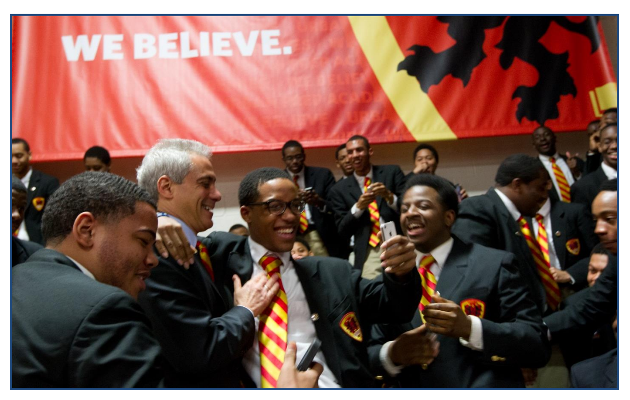
Mayor Rahm Emanuel and members of the Urban Prep Academy Class of 2014 in Chicago, Illinois, April 8, 2014.

In January , Mayor Walsh launched the Mayor's Mentoring Movement, an initiative in collaboration with Mass Mentoring Partnership to recruit 1,000 new caring adult mentors for Boston's youth. The target timeframe to meet the recruitment target is two years. At least 10 percent of the volunteers will be city of Boston employees. The effort will offer new empowering relationships for boys and girls ages 7 through 18.