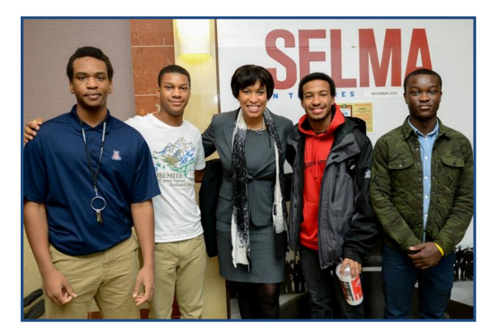
Mayor Muriel Bowser with students at a viewing of the film "Selma" in Washington, D.C.