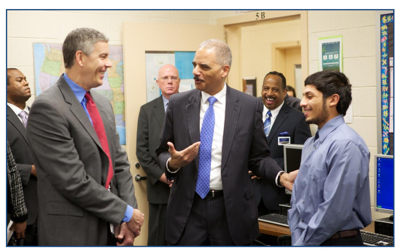
U.S. Department of Education Secretary Duncan and Attorney General Holder meet with youth and staff at the Northern Virginia Juvenile Detention Center School in Alexandria, Virginia, December 8, 2014.

In December 2014, U.S. Secretary of Education Arne Duncan and U.S. Attorney General Eric Holder announced a Correctional Education Guidance Package aimed at helping states and local agencies strengthen the quality of education services provided to America's estimated 57,000 young people in confinement every day. This guidance package builds on recommendations in the MBK Task Force report to reform the juvenile and criminal justice systems to reduce unnecessary interactions for youth and to enforce the rights of incarcerated youth to a quality education. The guidance package is a roadmap that states and local agencies can use to improve the quality of educational services for confined youth.