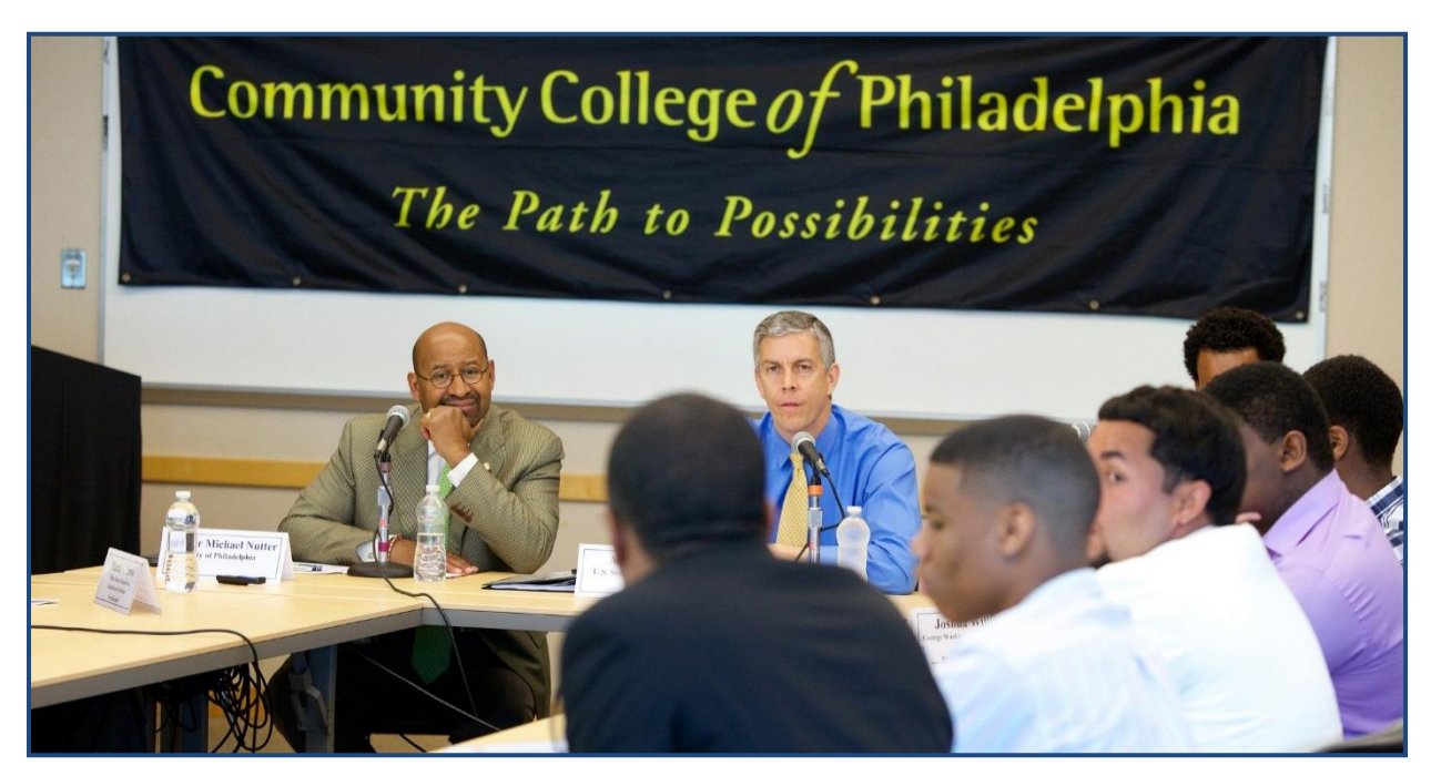
U.S. Department of Education Secretary Duncan and Mayor Michael Nutter at a My Brother's Keeper roundtable discussion in Philadelphia, Pennsylvania, July 11, 2014.

Later in November, the city hosted the first-ever MBK Youth Hackathon at String Theory Schools in center city, Philadelphia. The nongovernmental program, supported by Qeyno Labs and #YesWeCode, drew 95 participants (ages 13-20) to form teams and build apps focused on one of five tracks: education, health and wellness, restorative justice, food and sustainability, and masculinity. Each team spent approximately 54 hours taking their idea from concept to demo, and presented before a panel of judges and their peers.