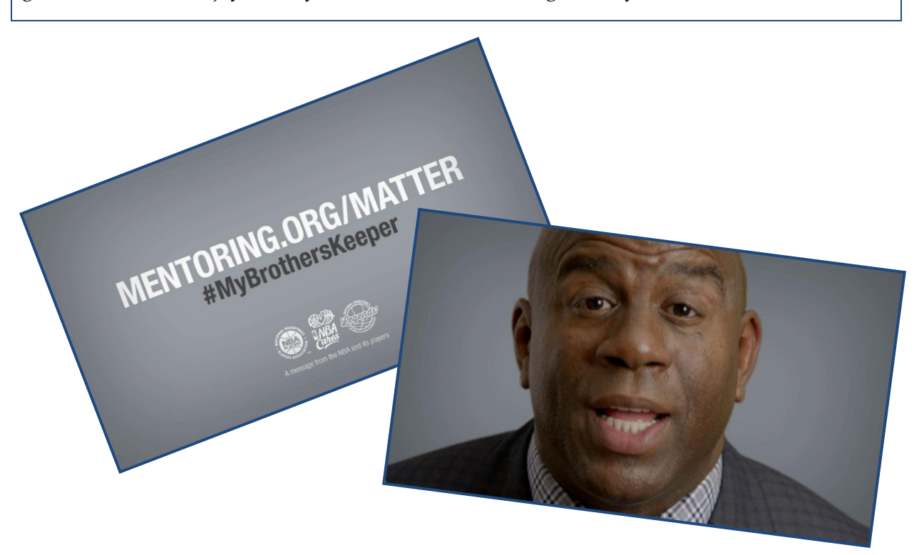
Stills from the "My Brother's Keeper: Be Someone Who Matters to Someone Who Matters" public service announcement.

Individual teams throughout the NBA are following suit and rolling out programs that amplify the NBA's overall commitment to action. For example, on January 11, the Memphis Grizzlies celebrated Mentor Night and premiered the "I Was That Kid" campaign, a player PSA initiative to support mentoring as a vital tool for student success. The campaign's call to action is one aspect of efforts to further mobilize mentor recruitment in Memphis, with a target of 5,000 new mentors by 2020. As part of the initiative, mentors and mentees will be given vouchers to enjoy healthy variations of traditional game day food.