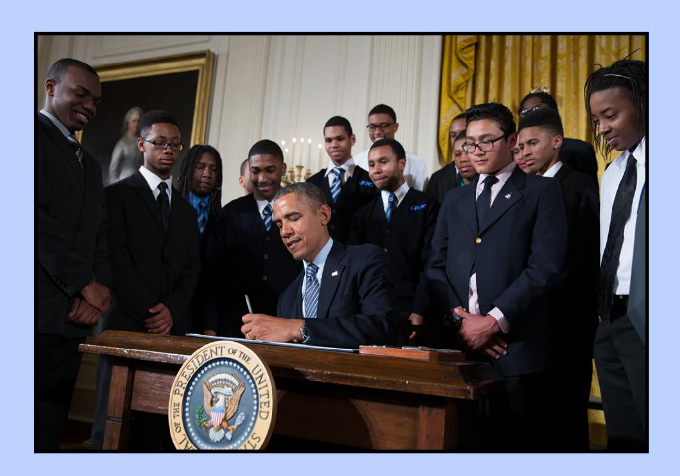
One-Year Progress Report to the President