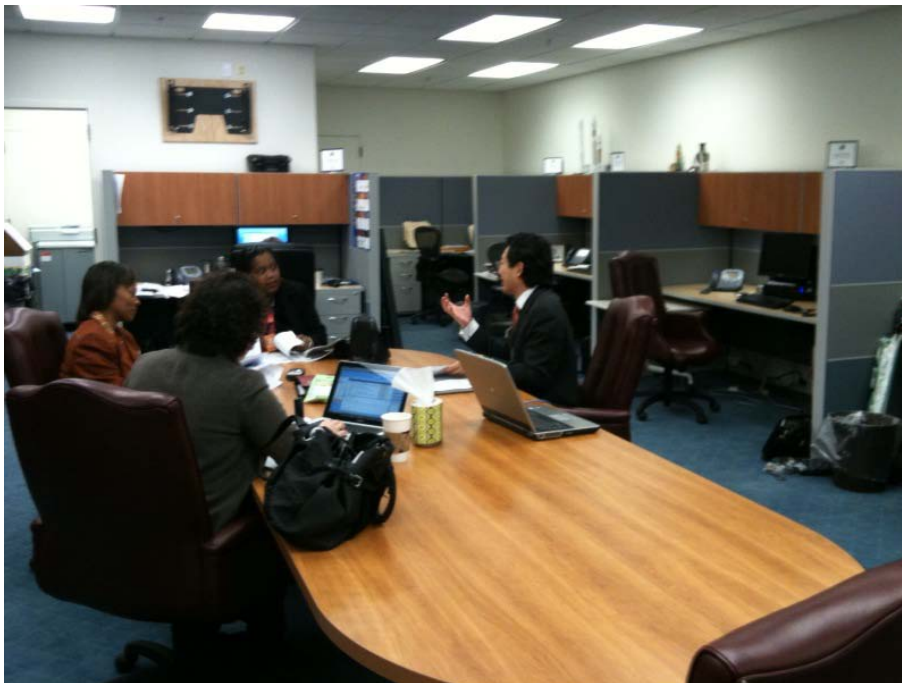
Figure 4 - OSTP Bullpen

To further encourage inter-office collaboration, we have altered our physical plant. The Technology Division of OSTP now sits in “open” office space. Most of the staffers sit around the perimeter of a large room with a conference table in the middle. The table serves as a locus for spontaneous convening and conversation.